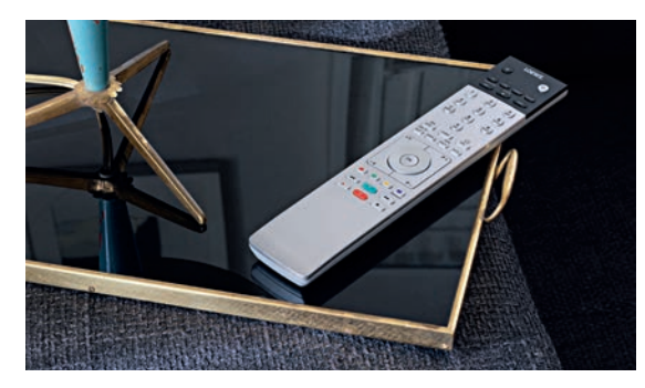
Quality you can feel: remote control with a high-quality aluminium surface.

Convenient and attractive: the aluminium table stand can be rotated 20 degrees in either direction.