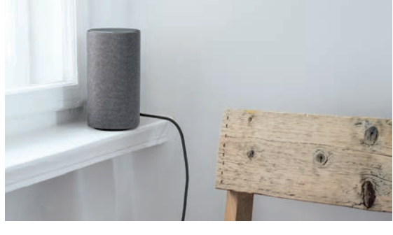
klang 1 speaker. Flexible stand solutions. High-quality, seamless fabric. Textile-covered cables.