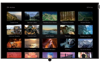
The new grid structure will help you locate recordings in your library even faster.