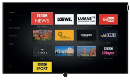
The redesigned home screen makes it even easier to access your favourite channels, connected devices and recordings.