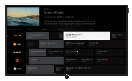
The beautifully simplified EPG design allows you to see what's on TV and to set recordings with ease.