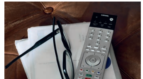
Quality you can feel: remote control with a high-quality aluminium surface.