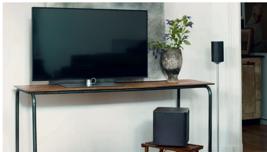
Two klang 1 speakers, one klang 1 subwoofer and the TV speaker as the centre speaker generate rich 3.1 sound.