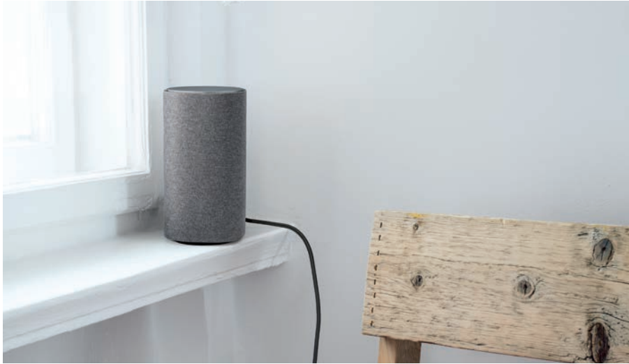
klang 1 speaker. Flexible stand solutions, high-quality seamless fabric in Graphite Grey, Light Grey or Black.