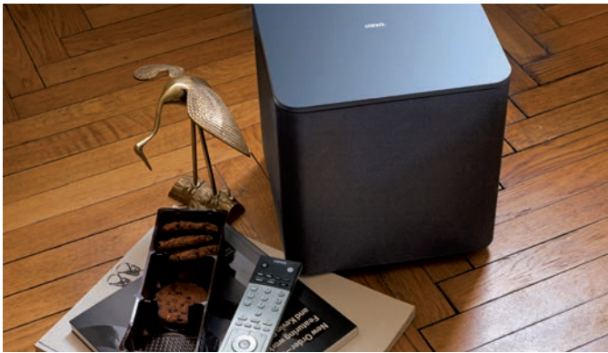
With a powerful 300 watts of music power, the klang 1 subwoofer provides particularly intensive low frequencies.